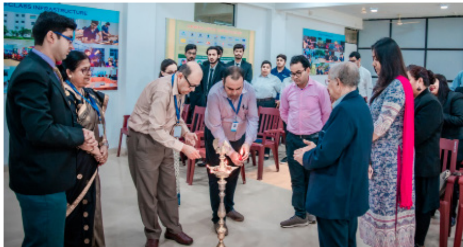
Pro V.C, Registrar along with the guests at the event inauguration

On 7 th March, 2020 the Department of Law of Brainware University organized a seminar on Career in the Legal Profession: A Roadmap Ahead. The program started with the Inauguration ceremony - Lighting of lamp and