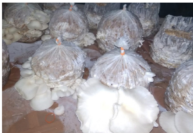
Hybrid Anti-Cancerous Mushroom Cultivation by Biotech Department of Brainware University