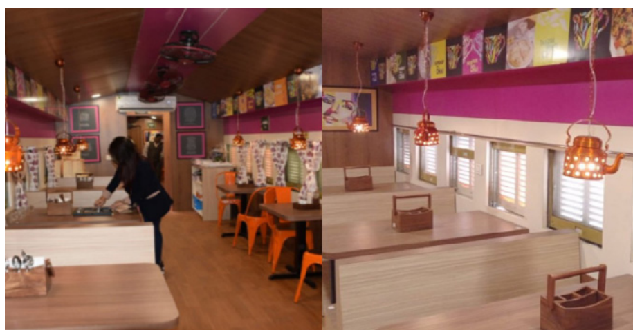
Rejected coaches turns into restaurant in Asansol

It is a full-fledged 42 seater restaurant serving breakfast, lunch, dinner as well. How cool is that isn't it? This innovative idea will not only