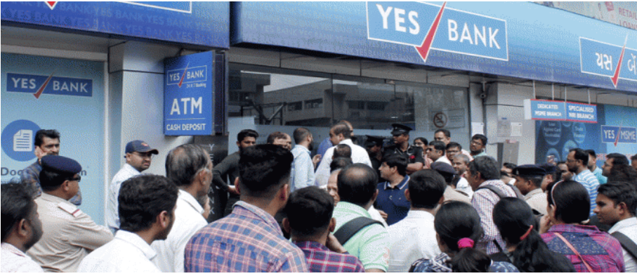
A crowd of account holders in front of Yes Bank

Yes bank is the 4 th largest private bank in India. The bank was founded by Rana Kapoor in 2004. On Thursday, 5 th of March The Reserve Bank of India imposed a temporary prohibition on Yes Bank. The RBI also capped the withdrawal for it's account