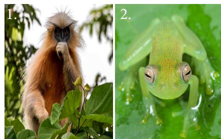
1. The Extinct Golden langur. 2. Redicovered Cochran Glass Frog.

On February 27 th 2020, the last existing golden langur was found dead. After it came in contact with a high